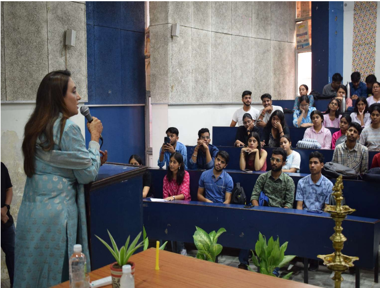
Speaker delivering session